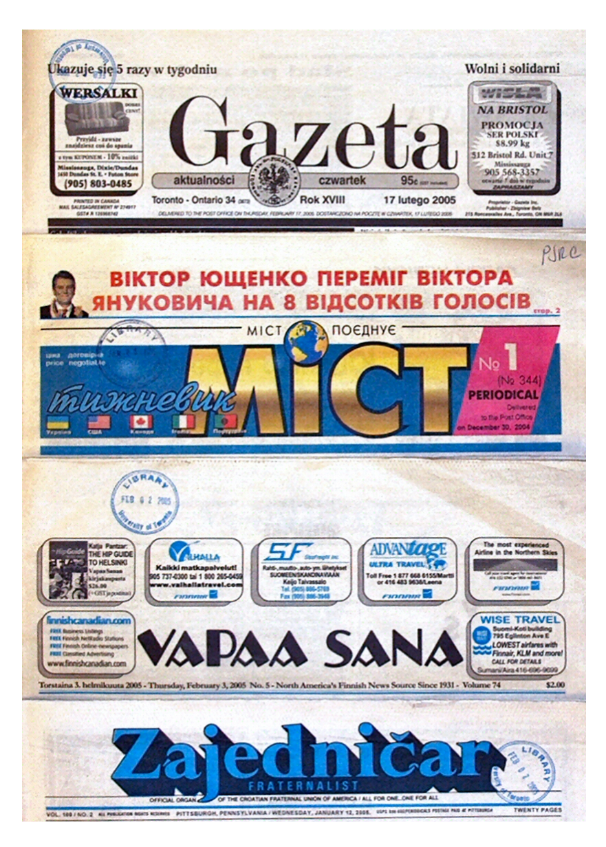
Four of the community newspapers received 'gratis' at PJRC.

casts from other countries in Eastern Europe. There have also been dealings and exchanges of books and information with Canadian diplomatic missions in Eastern Europe and the CIS. Funding is also being sought for the compilation of an index to the large microfilm holdings of the Peter J. Potichnyj Collection on Insurgency and Counter-Insurgency in Ukraine .